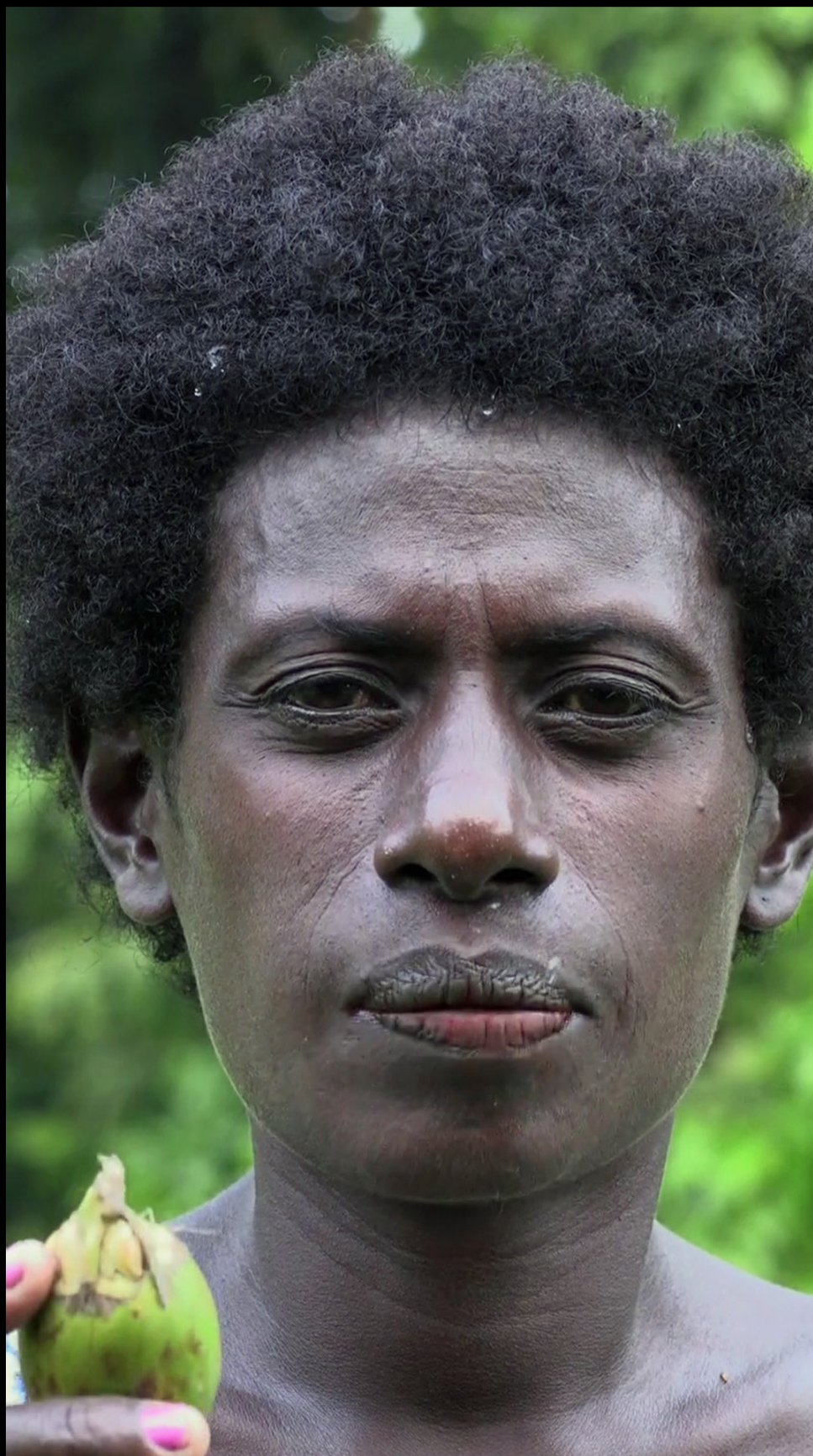
Image: Taloi HAVINI, Tsomi wan-bel (still image), 2017, 3 channel video, 9.42 mins

Tsomi wan-bel (win-win): Taloi Havini IRENE WATSON